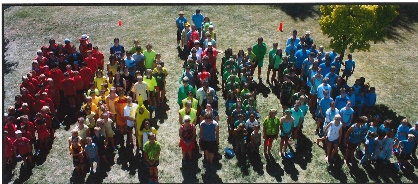
Students, Staff and Supporters spell out the word PRIDE at the launch day

Participation Respect Integrity Determination Empathy