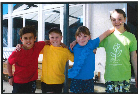
Students getting in the spirit of the day at the PRIDE launch

We know we have your support and example to lead us forward. Thank you to all who have shared our PRIDE launch day.